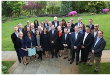
Participants in the thirteenth Executive Leadership Program, which took place in mid-May

MC Central Home > MasterCard Wins Leadership 500 Award for Excellence in Leadership Development