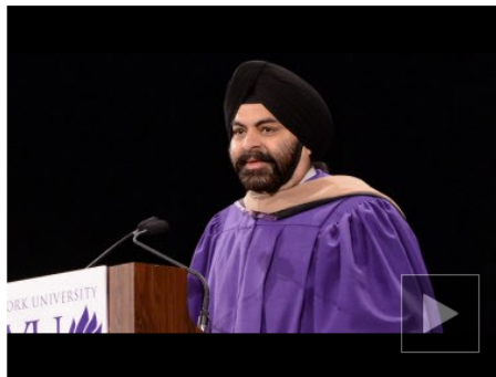
Ajay at the podium at the NYU Stern School of Business commencement ceremony.

MC Central Home > Ajay Banga Delivers Message of Equality and Diversity to Business School Graduates